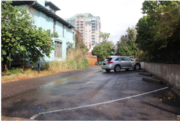
North parking lot, located on Grant St. between 2nd & 3rd Ave