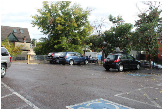
South parking lot, located on 2nd Ave directly next to the ASLD main building

If I am driving to the exhibit, I can park in one (1) of ASLD's two (2) parking lots, or on the street wherever designated.