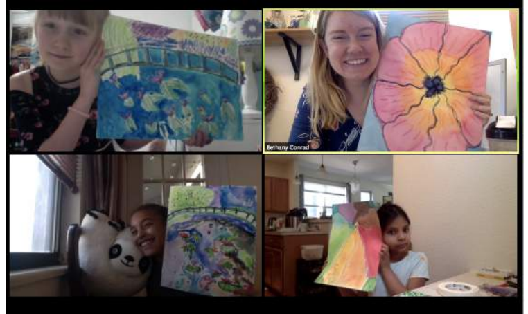
Screenshot from a Summer Camp taught via Zoom by faculty member Bethany Conrad

We had several major changes to our programming and budget, including: the closure of our building and suspension of in-person courses for five months; the cancellation of the 2020 Summer Art Market; and unforeseen expenses to pivot to virtual programming.