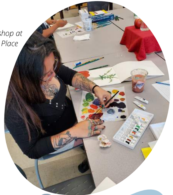
Painting workshop at The Gathering Place

Diversity in the Arts Internship Program